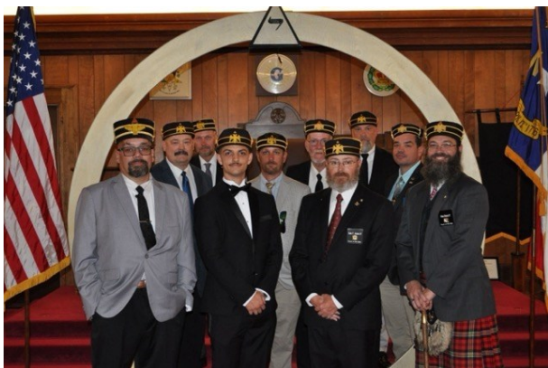
Scottish Rite Ring Ceremony: Look who is front and center!!