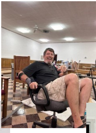
Brothers at work, trying to renovate our beloved building!