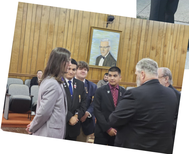
Below: DeMolay boys after their Installation of Officers.